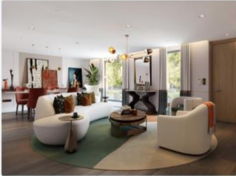
Garden Villas at Regent's Crescent start from £5,350,000. regentscrescent.com

Dominic Jeffares All articles by Dominic Jeffares