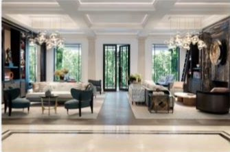
Prices for a four-bed property at Twenty Grosvenor Square start from £12gm. 20gs.com